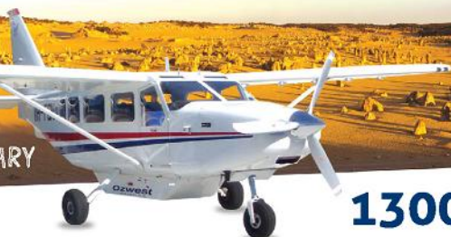
The Pinnacles